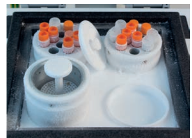
6 ... to avoid floating.