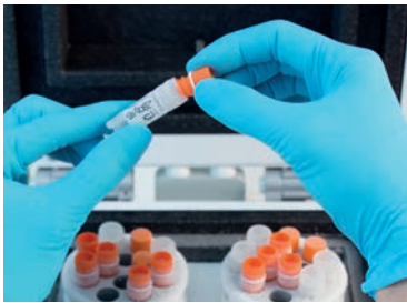
1 Open the properly identified cryovial.