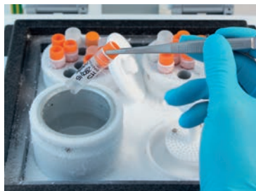
8 After time is expired open cover and extract the cryovial with the frozen specimen.