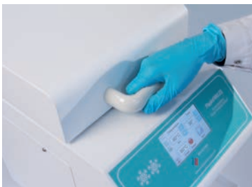
7 Close cover and start timer.