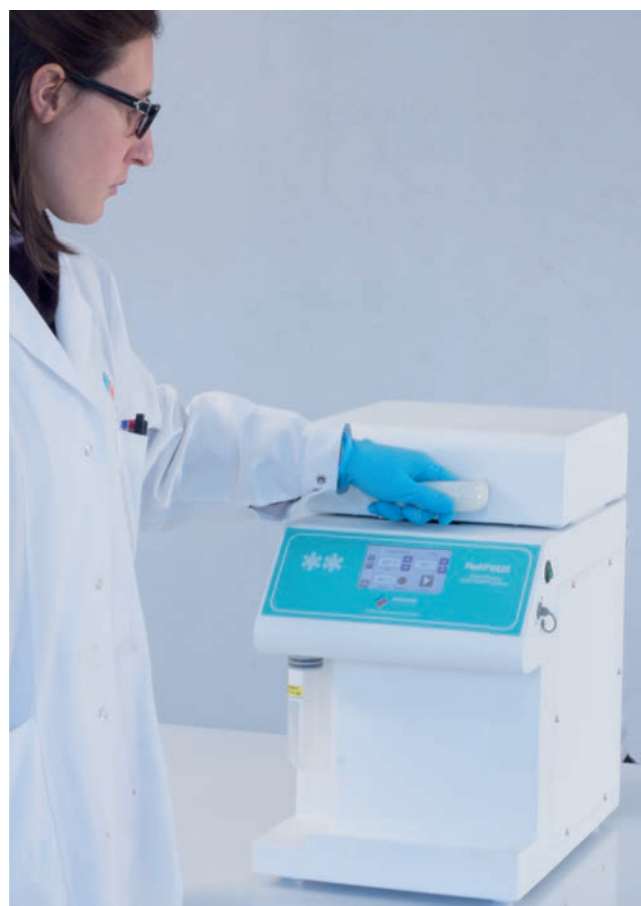
FlashFREEZE - Benchtop flash freezing station

There are few resources as valuable to cancer researchers as tissue samples - the biospecimens that patients donate to aid in the search for cancer-related biomarkers. Harvesting and storing human tissue for research purposes is not new. Human biospecimens have been collected and stored for 100 years, and today, in excess of 300 million biospecimens are warehoused in freezers or stored in other formats such as paraffin-embedded tissue blocks (1) . However, over the past decade or so it has become clear that the great majority of biospecimens stored in the world's biorepositories may not be suited for the state-of-the-art genomics, proteomics, metabolomics, and other bioanalytical technologies used today to search for cancer-related biomarkers. The irreproducibility of many reported biomarkers is due at least in part to the fact that the biospecimens utilized are often procured using different collection, processing and storage techniques.* Such variability can lead to significant differences in biospecimen molecular integrity.