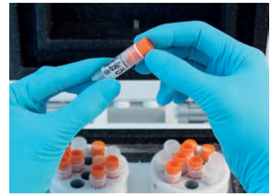
3 Close the cryovial.