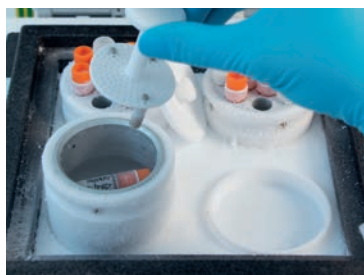
5 Place the special tool over the cryovial...