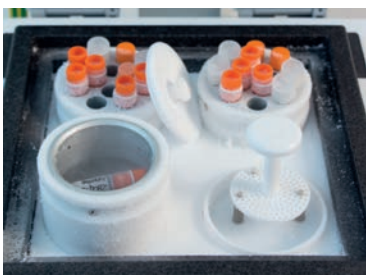
4 Place the cryovial in the freezing fluid.