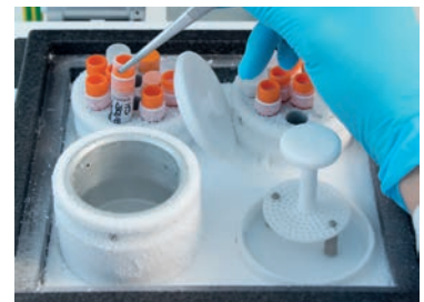
9 The cryovial can now be placed in the holder for storage.